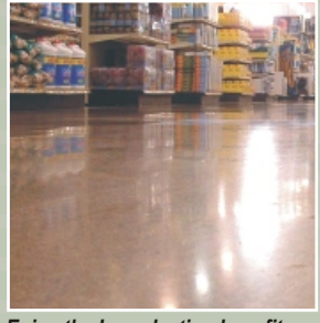
Enjoy the Long-lasting benefits that only FGS/PermaShine offers

Floorcare USA, following the simple steps of the FGS/PermaShine Polished Concrete application system, then applied L&M's exclusive FGS Hardener. FGS Hardener is a miracle of concrete chemistry that actually makes concrete more dense and harder where it counts: on the near-surface wear zone. The end result is a floor that is unusually resistant to chipping, flaking, and marring while its shine is being enhanced. There's no dangerous solvent or odor to deal with, either.