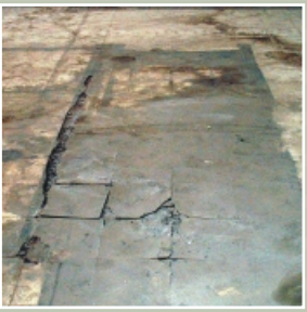
Remove and Repair

FGS/PermaShine® gives 109-year-old floor a new lease on life