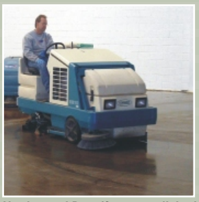
Harden and Densify your polished concrete with FGS Hardener Plus

But the results were beginning to show already.